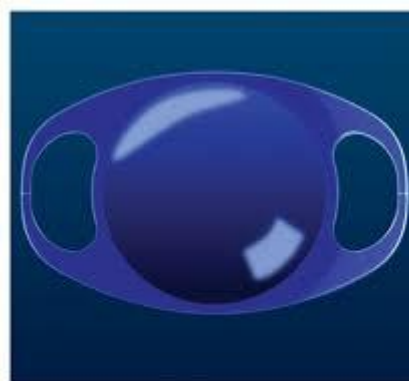
Figure 1. Schematic of the Artisan aphakic lens.

The present study aimed at assessing efficacy, predictability and visual outcomes of Artisan Phakic IOL in high myopia. Figure 1 shows the design of Artisan IOL