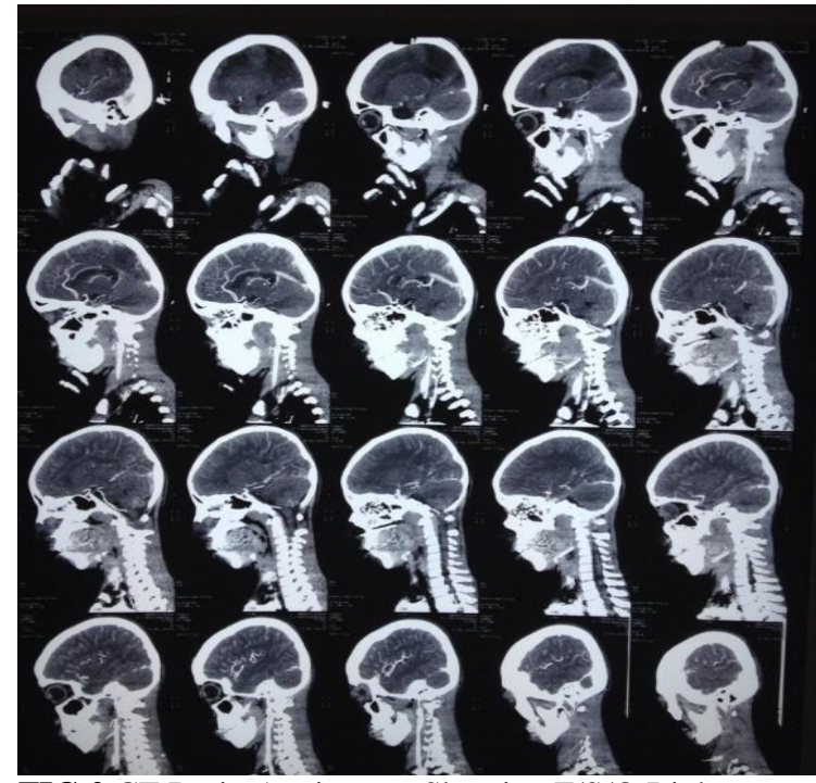
FIG.2 CT Brain Angiogram Showing F/S/O Right Cerebral Hemiatrophy