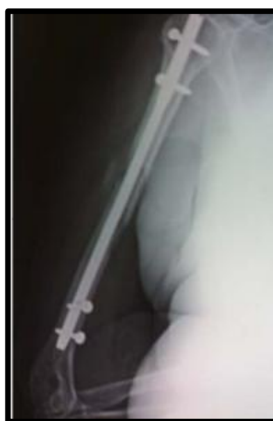
6 weeks post-op