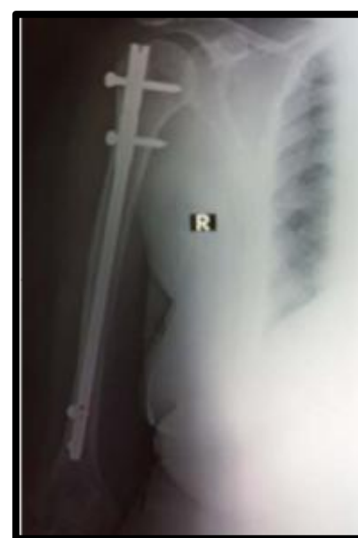
Union at 16 weeks