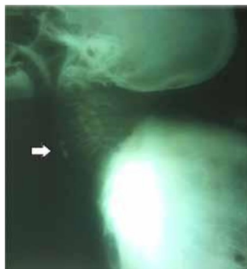
Fig.1- x- ray lateral view neck showing radiopaque shadow mimicking foreign body.

foreign body at the level of C-6 was done. Patient was taken for rigid esophagoscopy under general anaesthesia. No evidence of foreign body could be traced but double lumen of esophagus was seen at 30cms from the upper incisor teeth. At the level of double lumen in the esophagus the mucosa was congested and oedematous. However the second opening of the blind ended pouch was seen on left side of the main lumen of the esophagus. Patient has been further investigated with CT-scan of the neck to rule out radiopaque shadow which was seen in plain radiograph, confirmed by CT-scan as calcified cricoid cartilage (Fig.2). Later barium swallow x-ray (Fig.3) and flexible upper GI endoscopy was done, which confirmed the diagnosis of an epiphrenic diverticulum (Fig.4). Due respect to her age, general condition & minimum symptomatology patient has been deferred diverticulectomy and given a trial of conservative line of treatment. Patient responded well and follow up for 1 yr has been done. No dysphagia or any complications noted during this follow up period.