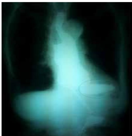
Fig.3 - Barium swallow x-ray showing epiphrenic diverticulum