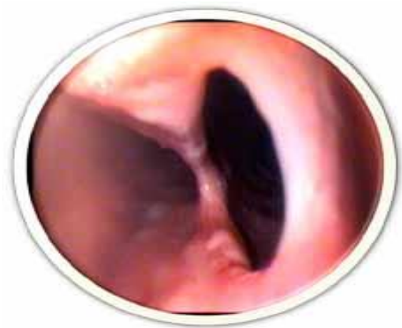
Fig.4 - Flexible upper GI endoscopy showing diverticulum