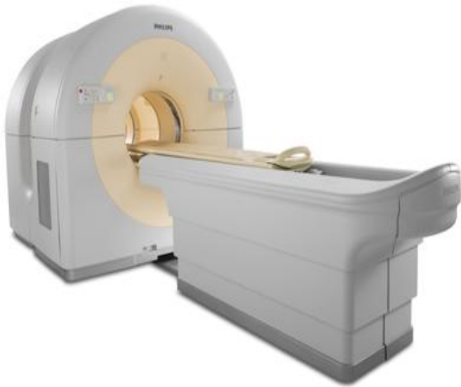
Figure 2- PET Scanner