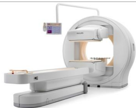
Figure 1- SPET Scanner

SPECT(Figure1) and MRI have been used for the imaging diagnosis of AD. and ^{18}\text{F} -FDG PET(Figure2) for early AD because of its higher sensitivity and higher spatial resolution. SPECT offers the advantages of lower cost and ease of access, which could lead to a large increase in the number of cases being studied with this technique. Few studies have directly compared brain perfusion SPECT and PET in differential AD from other types of Dementia.(3)