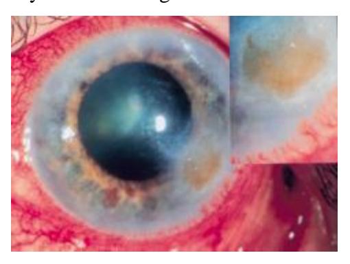
Fig.1 Corneal Ulcer With Fungal Overgrowth

A young boy of 17 years of age came up at a tertiary care hospital situated at a rural place in Nagpur, Maharashtra, India with a foreign body injury probably a stick to the right eye with his cornea teared on the 2<sup>nd</sup> day after injury. Initially on the 1<sup>st</sup> day he noticed redness, lacrimation and slight pain in the eye on arriving at home which was relieved on hot fomentation for few minutes. On next day morning patient experienced severe lacrimation, pain and redness in the affected eye with blurring of vision.