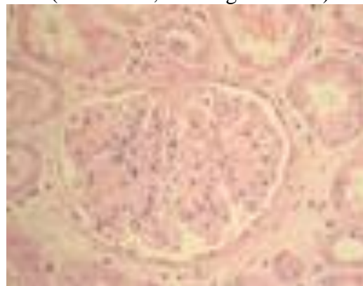
Fig 3.- The histopathology of the glomeruli showing diffuse increase in mesangial matrix with thickened capillary walls and a nodule (kimmelstiel-wilson lesion) of diabetic glomerulosclerosis (H&E stain, 40x magnification)

Post operatively patient was started on higher antibiotics. Injection meropenem, and injection metrogl were started according to patients creatinine clearance. Patient was in hypotension and hence was put on inotropic support. Post-operative urea was 53.7 and serum creatinine was 2.8. Total leucocyte counts were 24000/cumm. The patient's condition progressively worsened and took a rapid downhill course, despite aggressive hemodynamic and inotropic support. Finally, the patient developed an intractable septicemic shock and died on 4 th post operative day. .