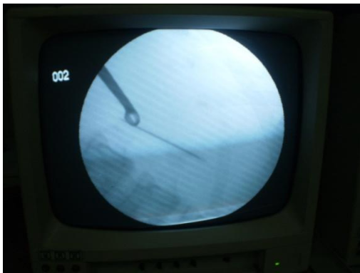
Fig 1: Shows Needle visualised in C-arm Localised with haemostatic forceps