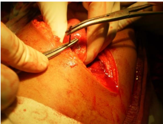
Fig 2: Intra op removal of needle from kidney