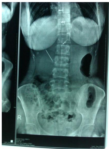
Fig 3 : X ray image of Foreign body