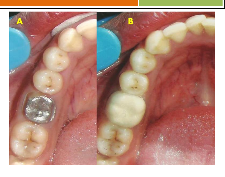
Figure 3: (A) Split cast post core system cemented in place (B) porcelain fused to metal crown cemented on cast split post core system