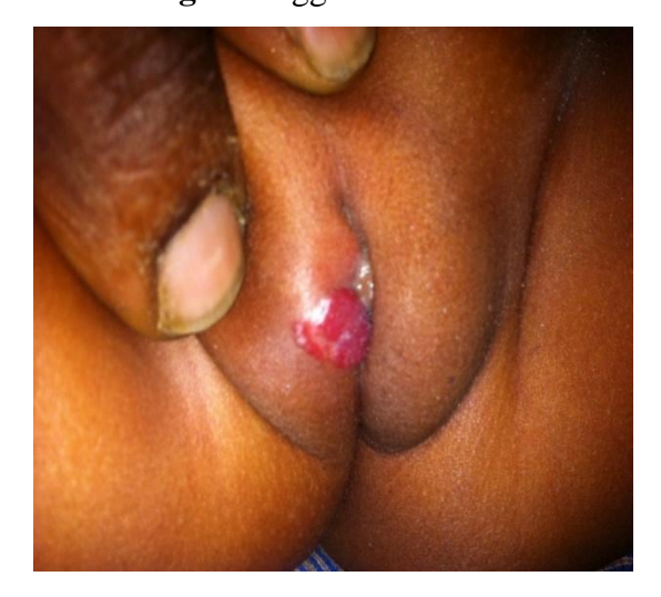
Fig 4- Hemangioma