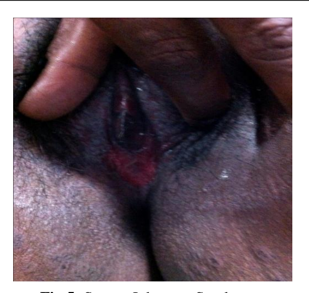
Fig 5- Steven Johnsons Syndrome